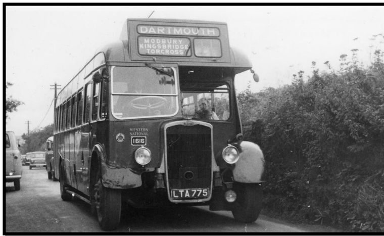
A Western National Bristol LWL of 1951 leads along the A379 towards Dartmouth with a queue of holiday and local traffic behind – nothing new here! Sister vehicle 1613 is preserved by the Trust and will be on static display in the bus station.