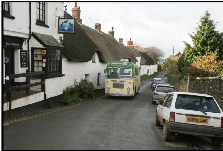
A Western National Bristol SUL coach exploring routes for the running day heads up from the beach on its way back to Kingsbridge. The 161 route went via Thurlestone and Buckland in the early '90s.