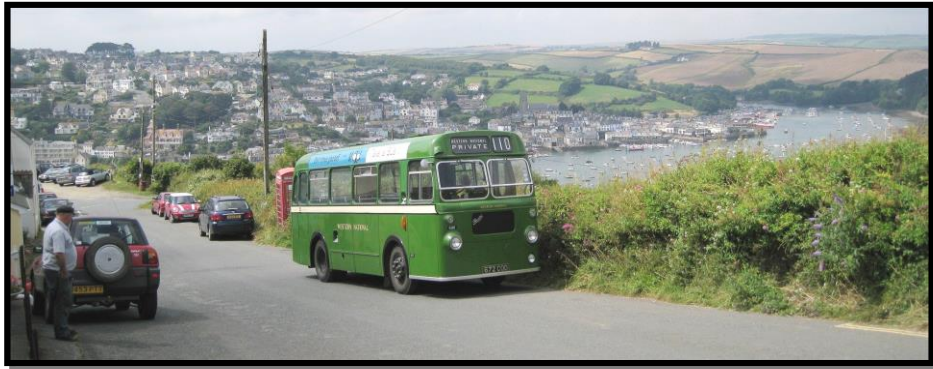
Colin Billington's former Western National Bristol SUS at the East Portlemouth terminus of Route 110 high above the Kingsbridge Estuary with Salcombe in the background, taken earlier this year when exploring routes for the running day.