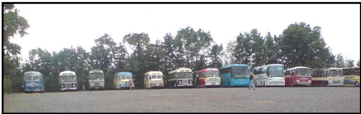
A line-up of some of the coaches, vintage and modern, which attended last year's event